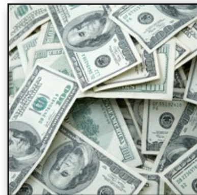
Move from Success to Significance